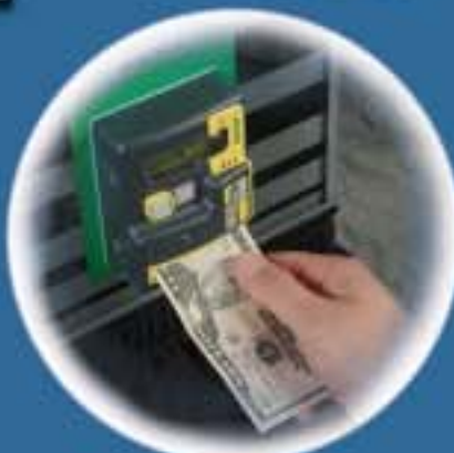
*Pictured with Optional Credit Card Combo Bezel, standard system accepts cash only.